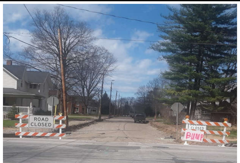
W. CHERRY STREET CONSTRUCTION has progressed to having the base of street and walks ready for paving and concrete. BEWARE the deep bump from Main Street if you dare drive it.