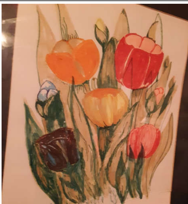
Painting and Photo by J.W. Brewer