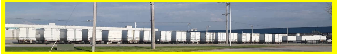
TRAILERS ON STORAGE LOT AT WHIRLPOOL WHICH HAS CUT PRODUCTION 55%