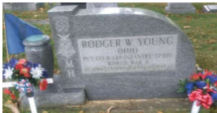
Rodger Young stone in McPherson Cemetery

"I'll get it!" Private Rodger Young shouted as he ran uphill toward a Japanese machine gun bunker. As he threw a grenade into the nest, he was felled by several shots as the grenade killed all the enemy.