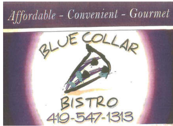
MAPLE and NORTH MAIN south of 20